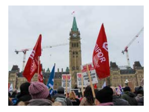
Read Unifor's submission to the consultation on the 2023 Federal Budget: Building Resilience and Shared Prosperity.