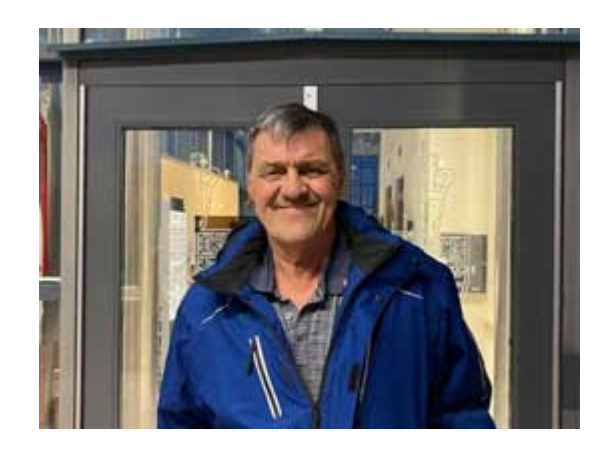
A private member's bill with all-party support in the House of Commons currently before the Senate could fundamentally improve pension security for retirees across the country.