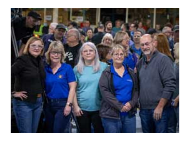
GM St. Catharines members have secured a bright future, building electric vehicle propulsion systems for years to come. See photos from this historic announcement.